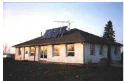
a Stelle straw bail solar powered home

Yes, modern life! This is no Amish town! Over the years, Stelle has found ways to be in sync with technology and sustainability. A windmill turns complacently in the breeze generating electricity for the water treatment plant and telephone company also offering high speed internet service. (On its website, Stelle Telephone claims to be the first solar-powered telephone switches in North America totally independent from the electric grid.). Most of the homes boast of solar panels as Stelle houses the Midwest office of Sunwize, a pioneering solar engineering company. A little closer to the ground, many families share in the work and harvest of a community organic garden and orchard. Community activities include Earth Day and other seasonal celebrations as well as school, lunch and dinner co-ops.