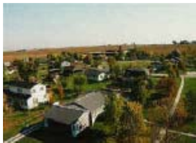
a arial shot of Stelle, Illinois

Located about 30 miles southwest of Kankakee, halfway between interstates 55 and 57, there is no way to get to Stelle without weaving through picturesque fields of corn and soybeans. Entering Stelle is like turning into a well-kept subdivision of mostly ranch style homes with neat lawns and perennial flowers waving everywhere. At first the windmill and gleaming solar panels are your only clues that something is different about this country community. For more information, please visit http://www.stellecommunity.com/ .